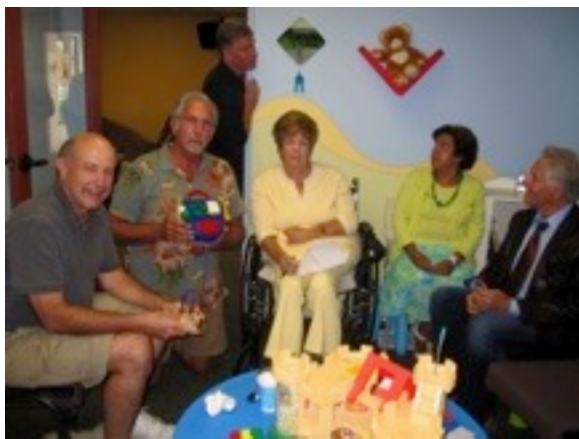
The Mentor Team

...sure to let us know if you spot anyone of us (on the "net".)